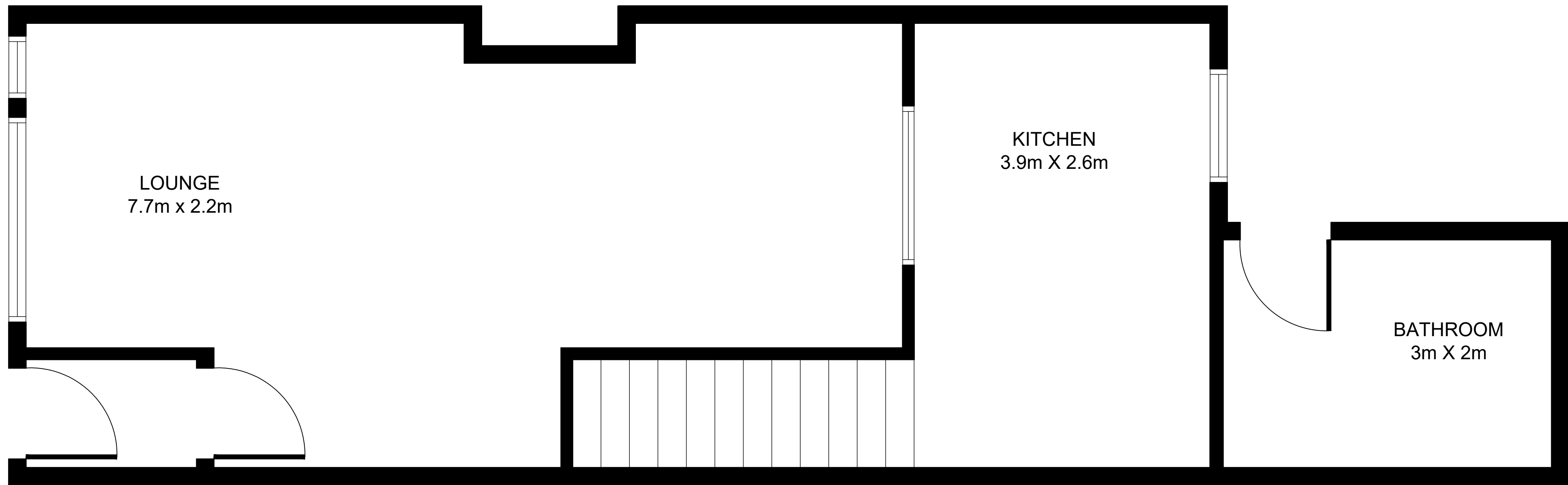
1 GROUND FLOOR PLAN